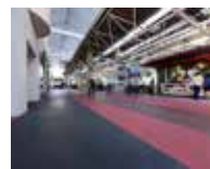
Transport & Railways