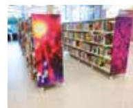
Education & Offices