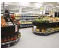
Retail & Shopping Malls