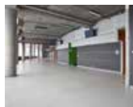
Public Spaces & Leisure Facilities