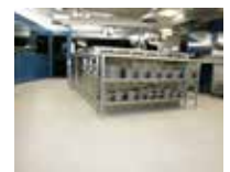
Industrial & Food Productions

To arrange your free flooring consultation, get in touch today!