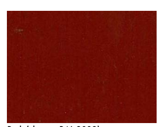
Red (close to RAL 3009)