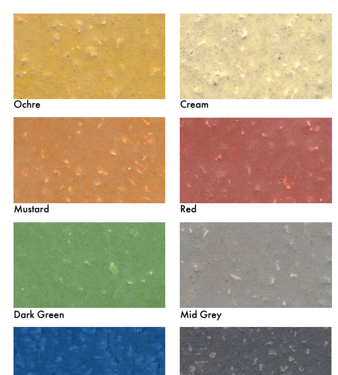
The applied colours may differ slightly from the examples shown above. Contact our customer services for a true colour sample or a special colour match. Special corporate colours and designs can be produced to special order.