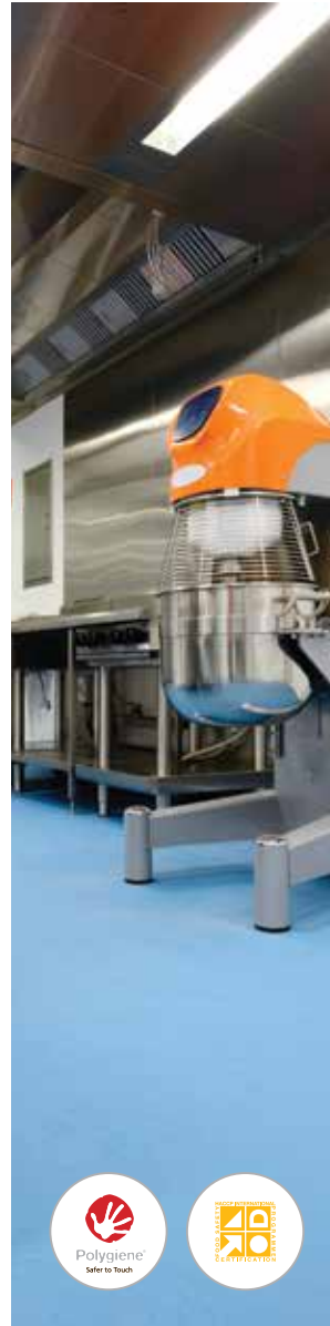
Catering Kitchens & Food Service Areas