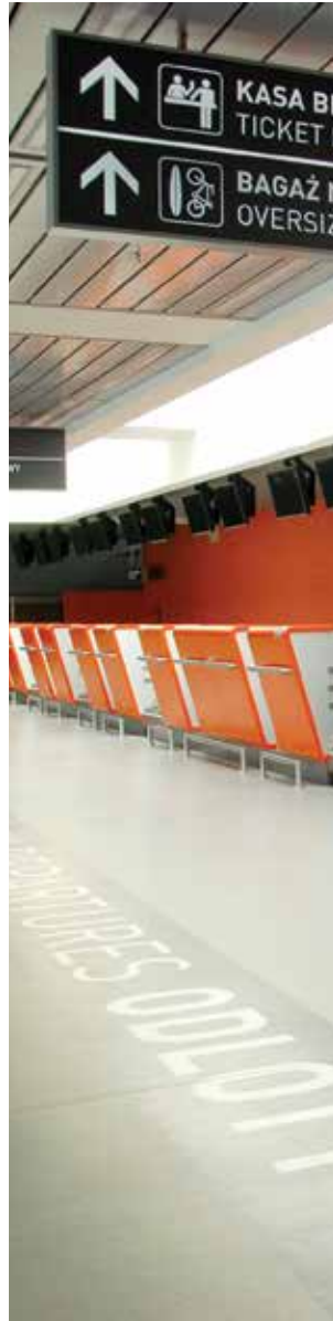
Front of House & Baggage Handling