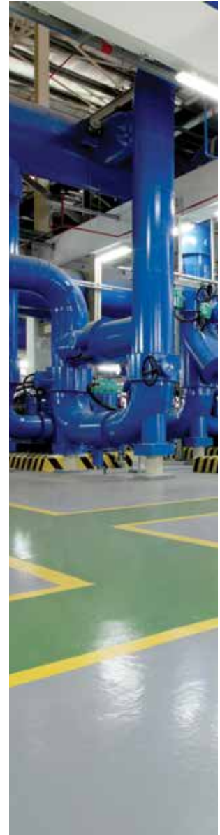
Plant Rooms & Maintenance Areas