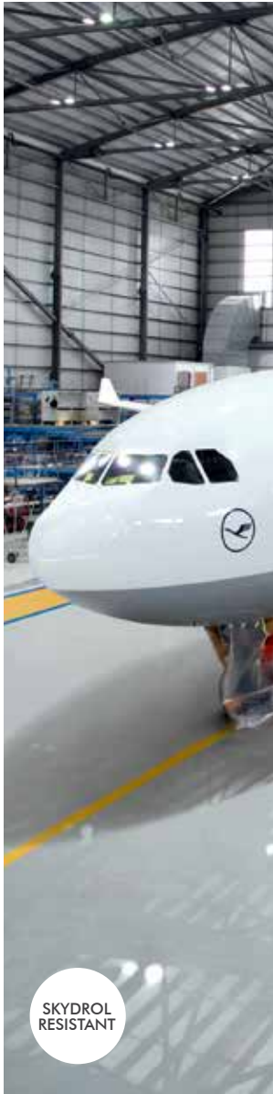
Aerospace & Hangar Environments