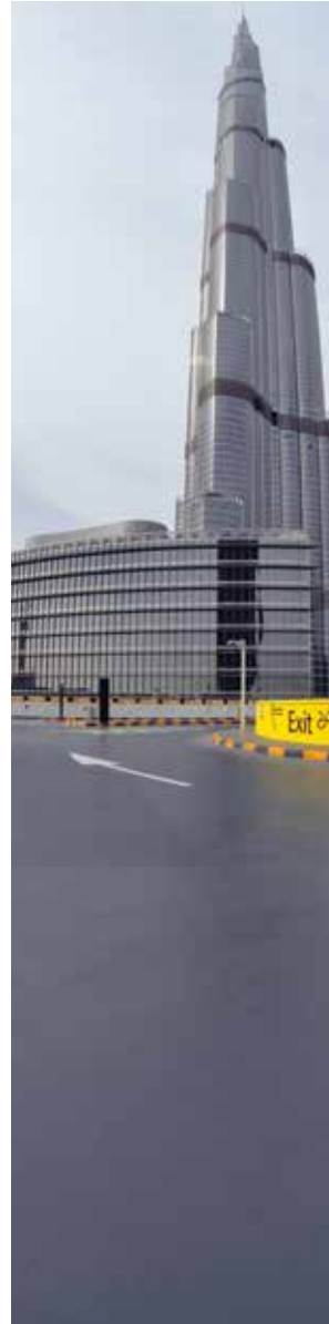
Parking Structures (External Decks)

With an experienced fleet of flooring professionals across the globe alongside the backing of a major US manufacturing group, Flowcrete offers those involved in airport design and refurbishment, floor solutions that significantly out-perform cheaper alternatives.