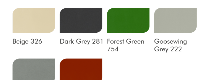
Mid Grey 280 Tile Red 637

Seamless installation ensures dirt and dust are easily cleaned away.